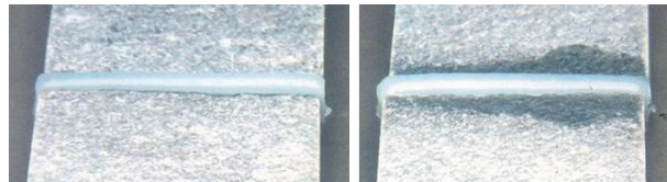
Hybrifix® 302 Hybrid Adhesive & Natural Stone- No surface contamination

Hybrifix®302 Hybrid Adhesive & Natural Stone is applicable on natural stone and other porous surfaces. Due to the fact that Hybrifix®302 does not contain plasticisers, contamination of the adjacent contact surfaces